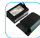
Double battery incl. battery door