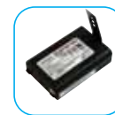
Standard battery excl. battery door