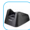
Cradle single slot USB